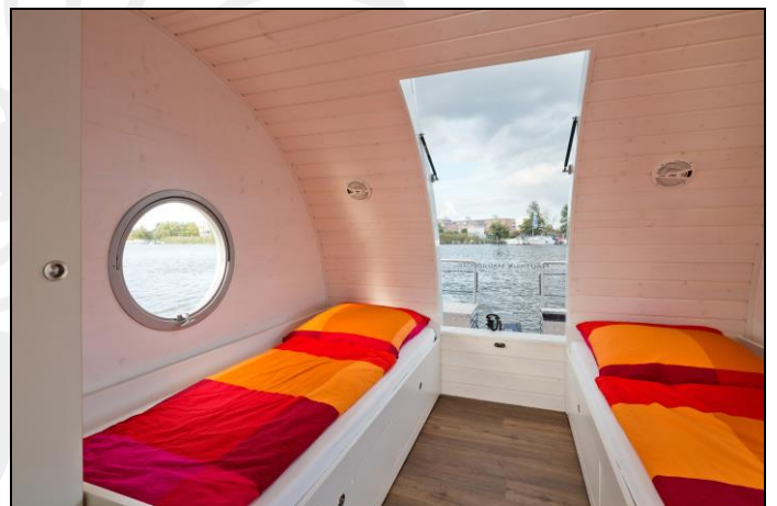
Bedroom with a double bed that can be pulled out (optional)