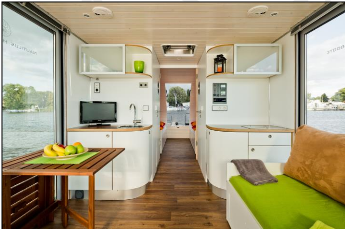
Living room (furniture optional)