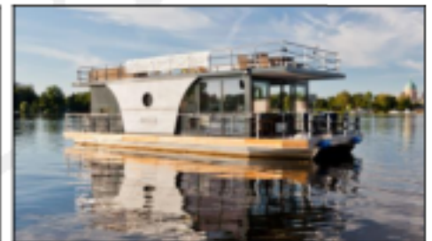
Examples of design