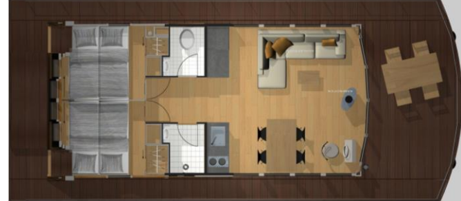
Layout basis version ground floor