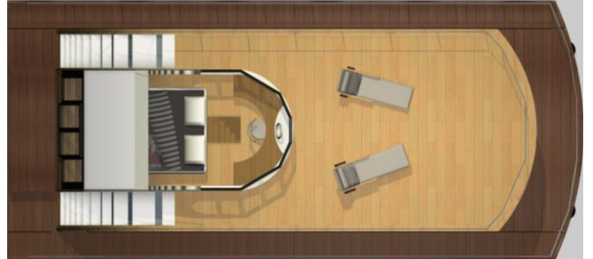
Upper deck + cabin